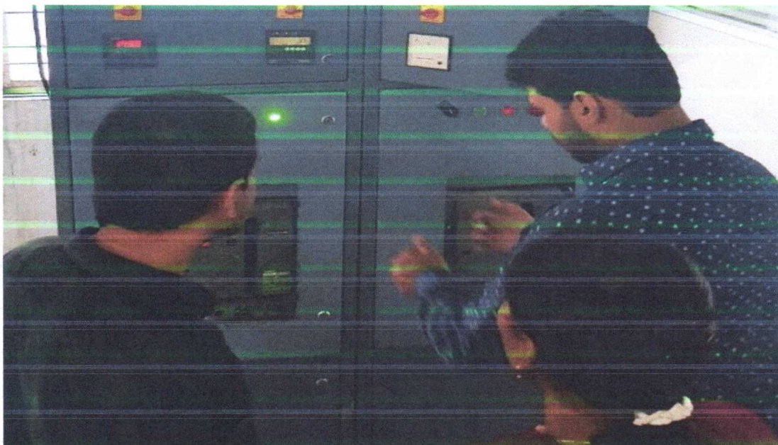
Company official explaining working of automation panel