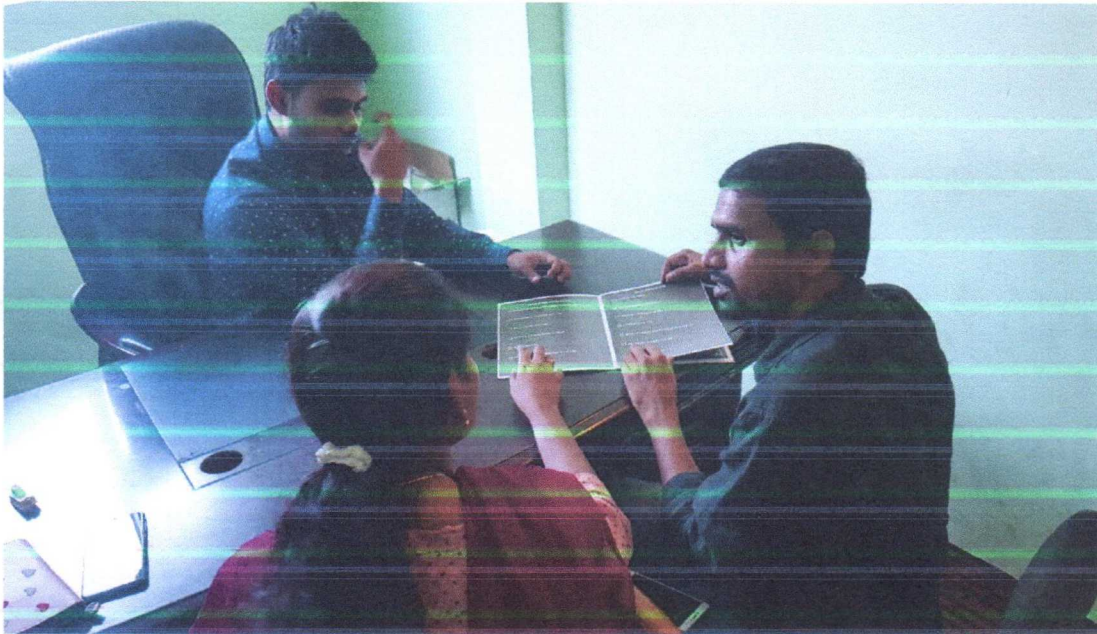
ENRUN INDIA Managing director explaining their achievements