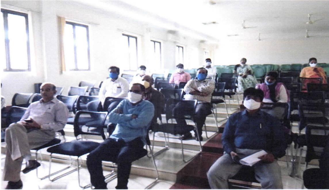
The staff participated in the Celebration of Engineers Day-2020