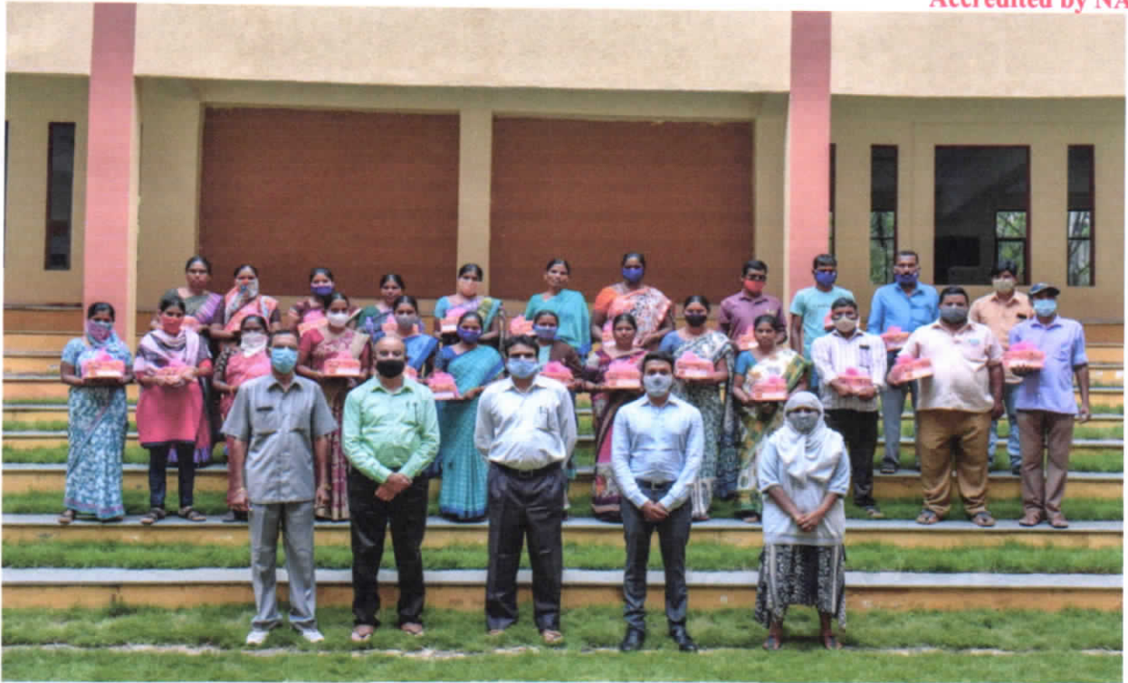
Group photo with non-teaching staff