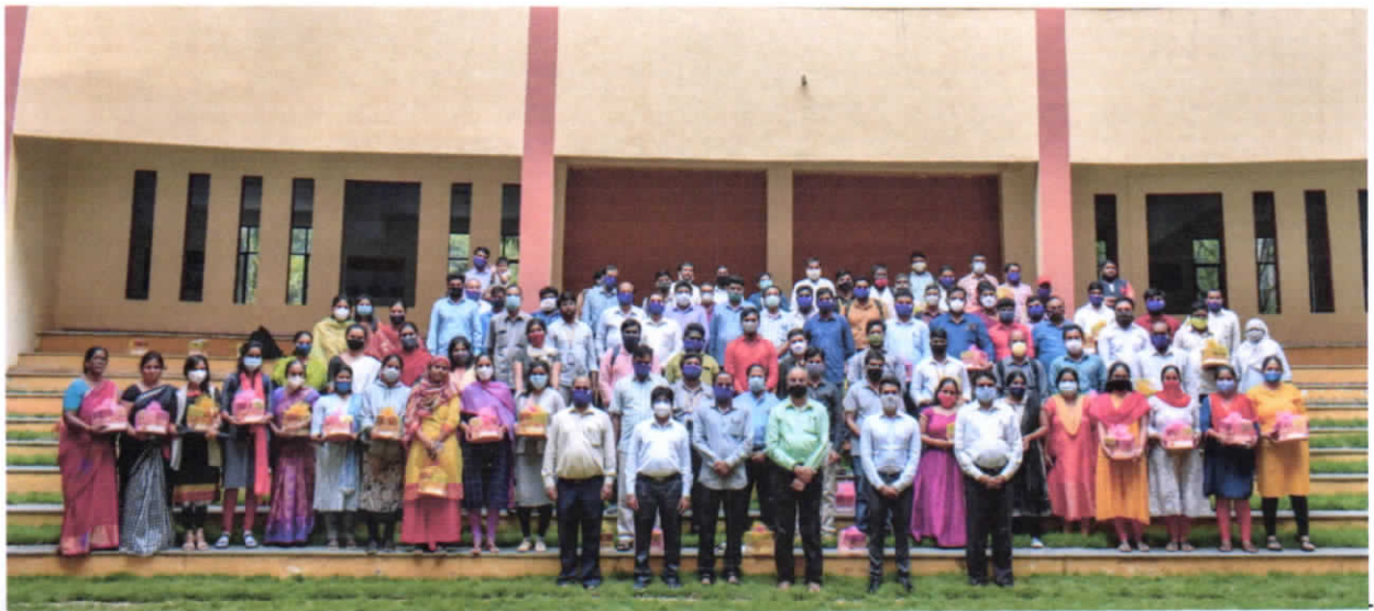
Family of KG Reddy College of Engineering and Technology.