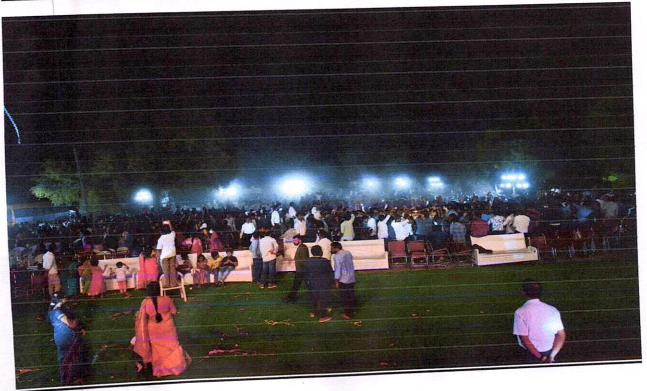
Finally the DJ, the most awaited segment of the Annual Day.