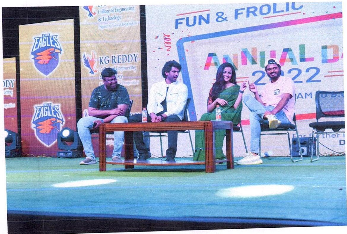
Telugu cine stars enjoyed interacting with the audience.