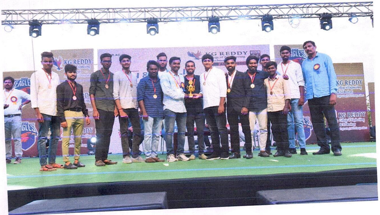
The Sports team getting their trophy.