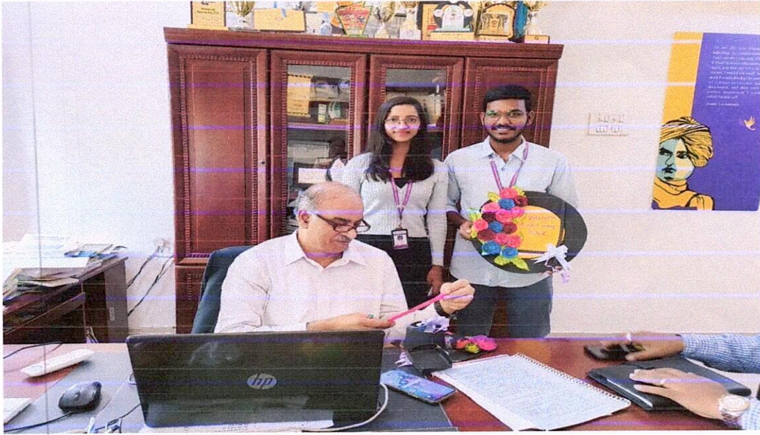
Principal sir being invited by the students organizing team.