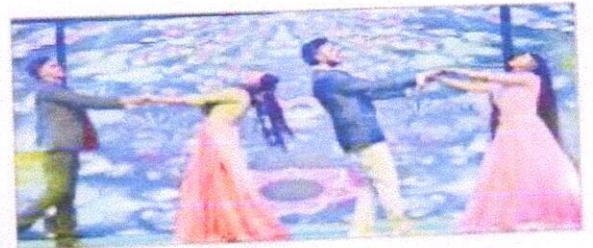
డ్యాన్స్ చేస్తున్న విద్యార్థులు