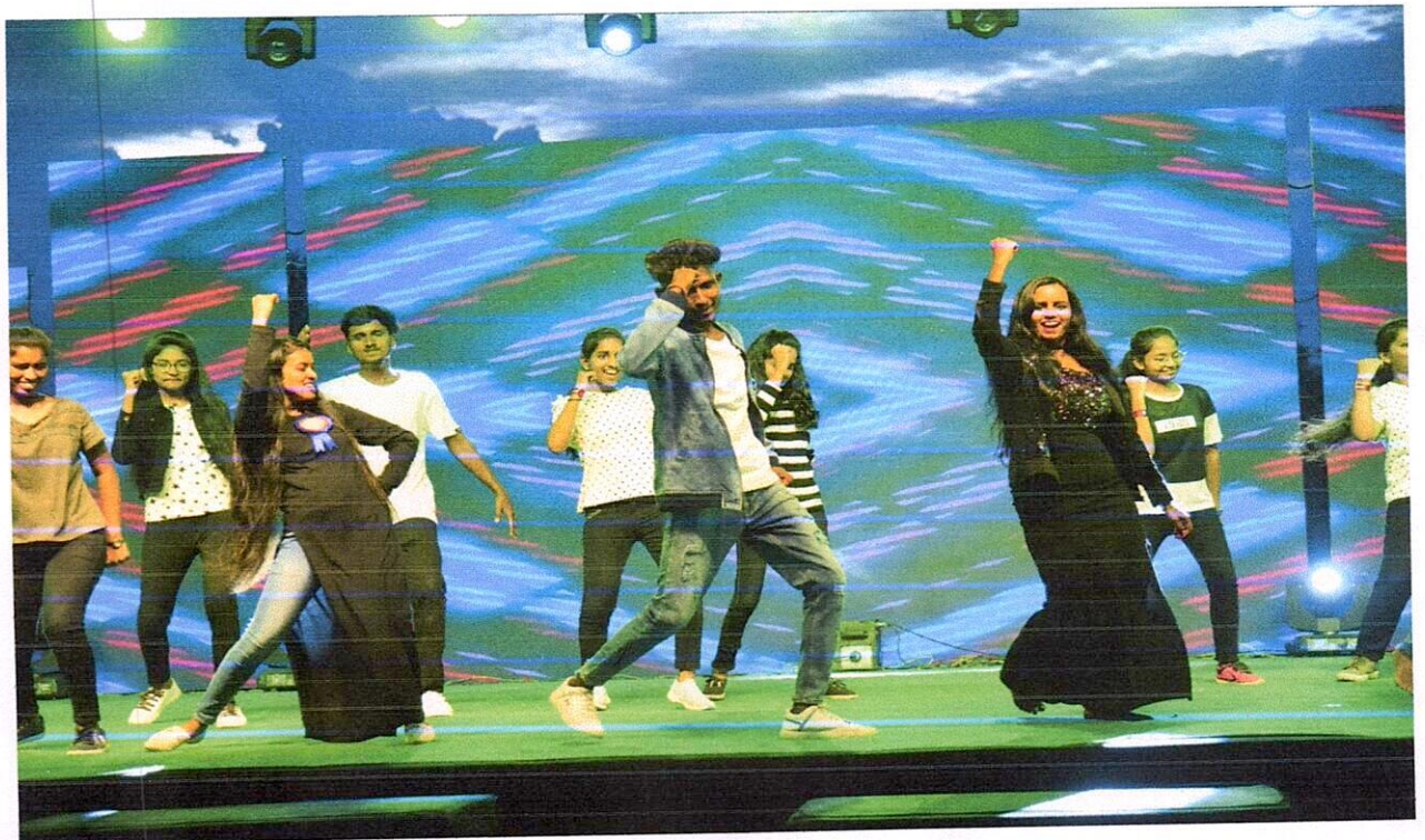
Students enjoyment in a group dance.