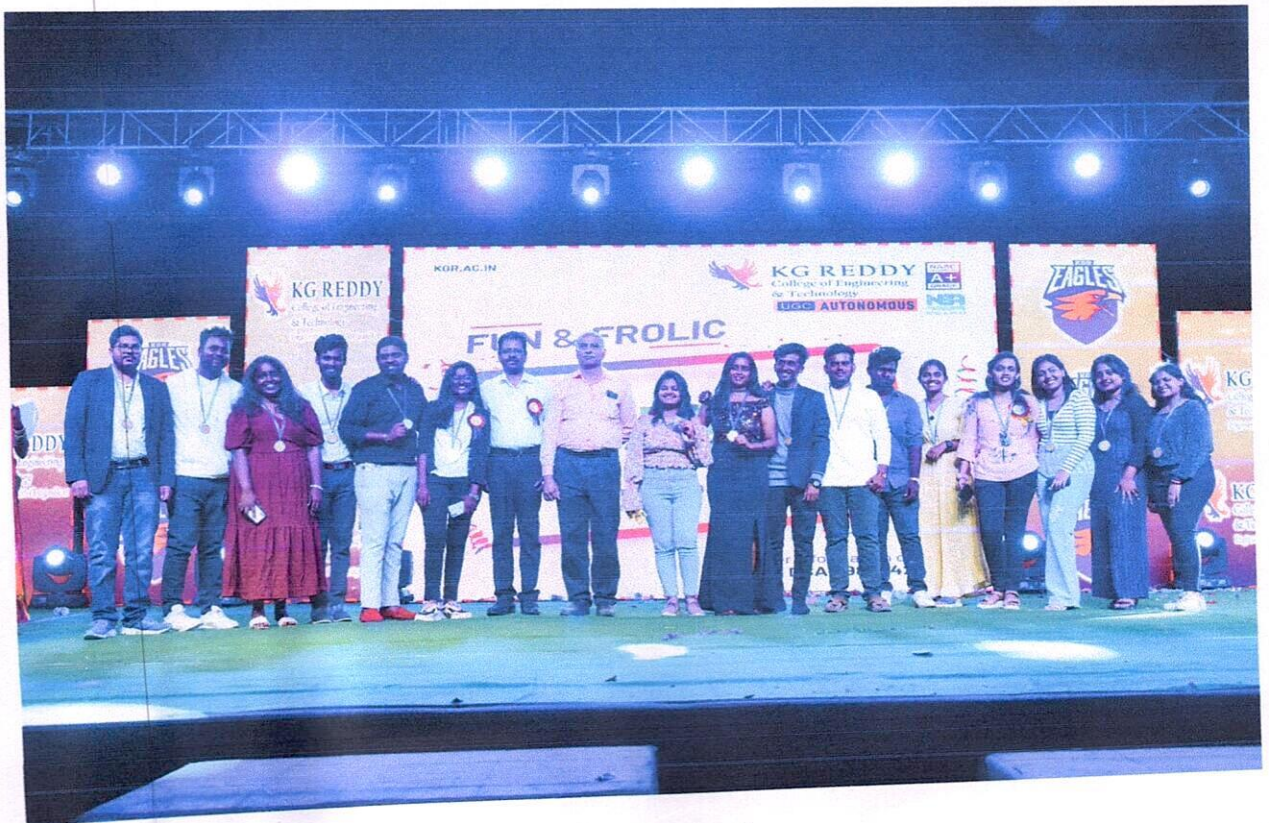
The PVF team being awarded for doing tremendous work.