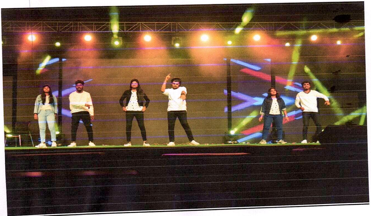
A group dance which was very much liked by the audience.