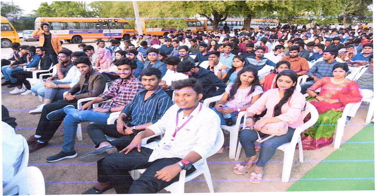
The students in the audience enjoying thoroughly.