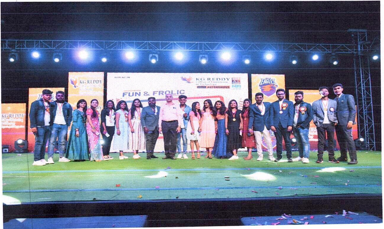
The student volunteers were felicitated who helped in organizing the program.