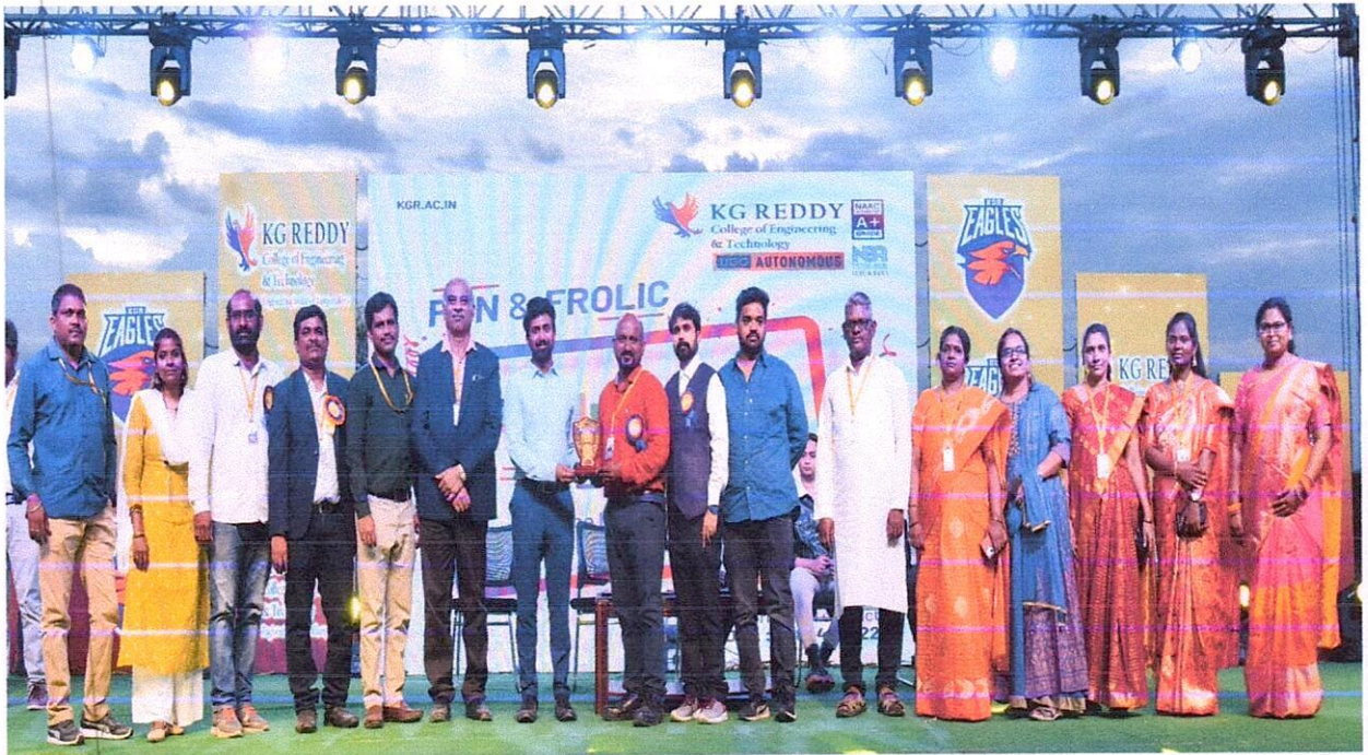
The ECE department bagged the Best Department Award.