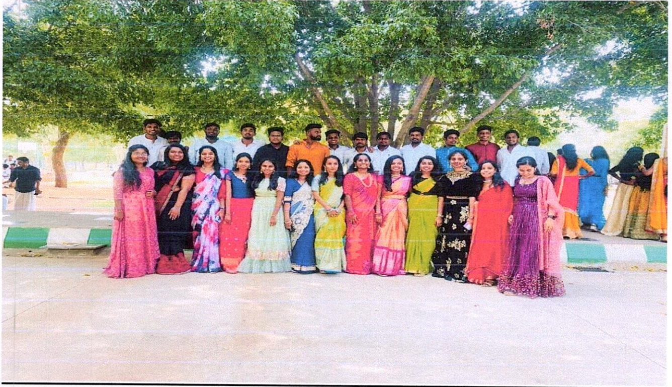
A group of students flaunting their attires.