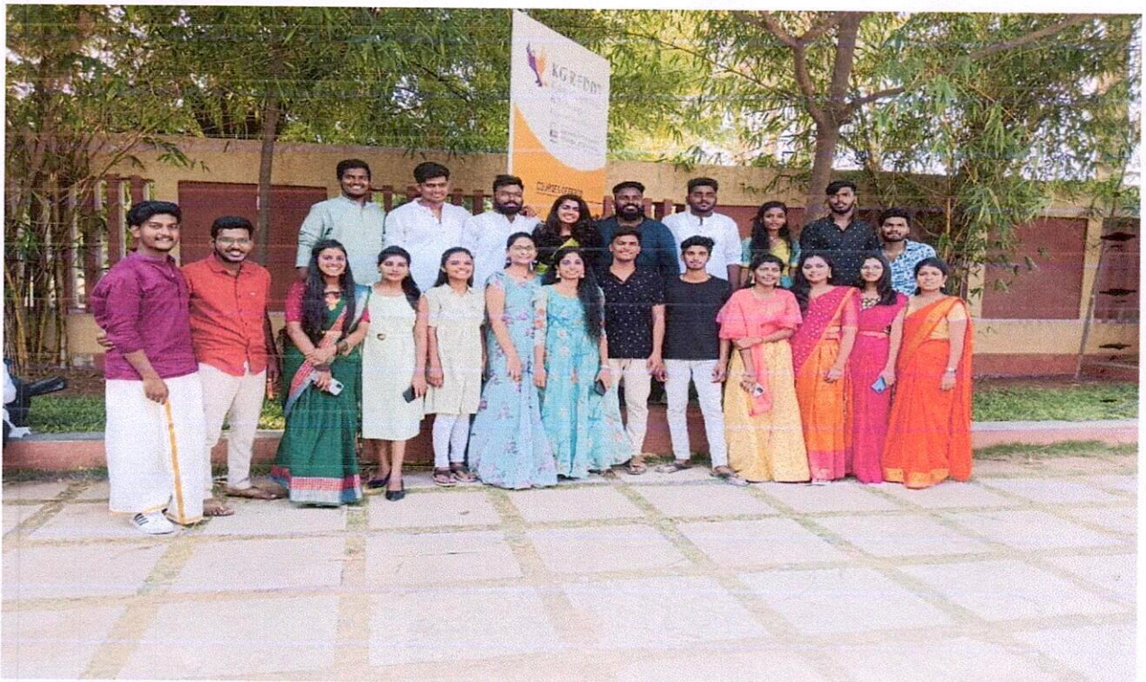
A group of students at their Traditional best.