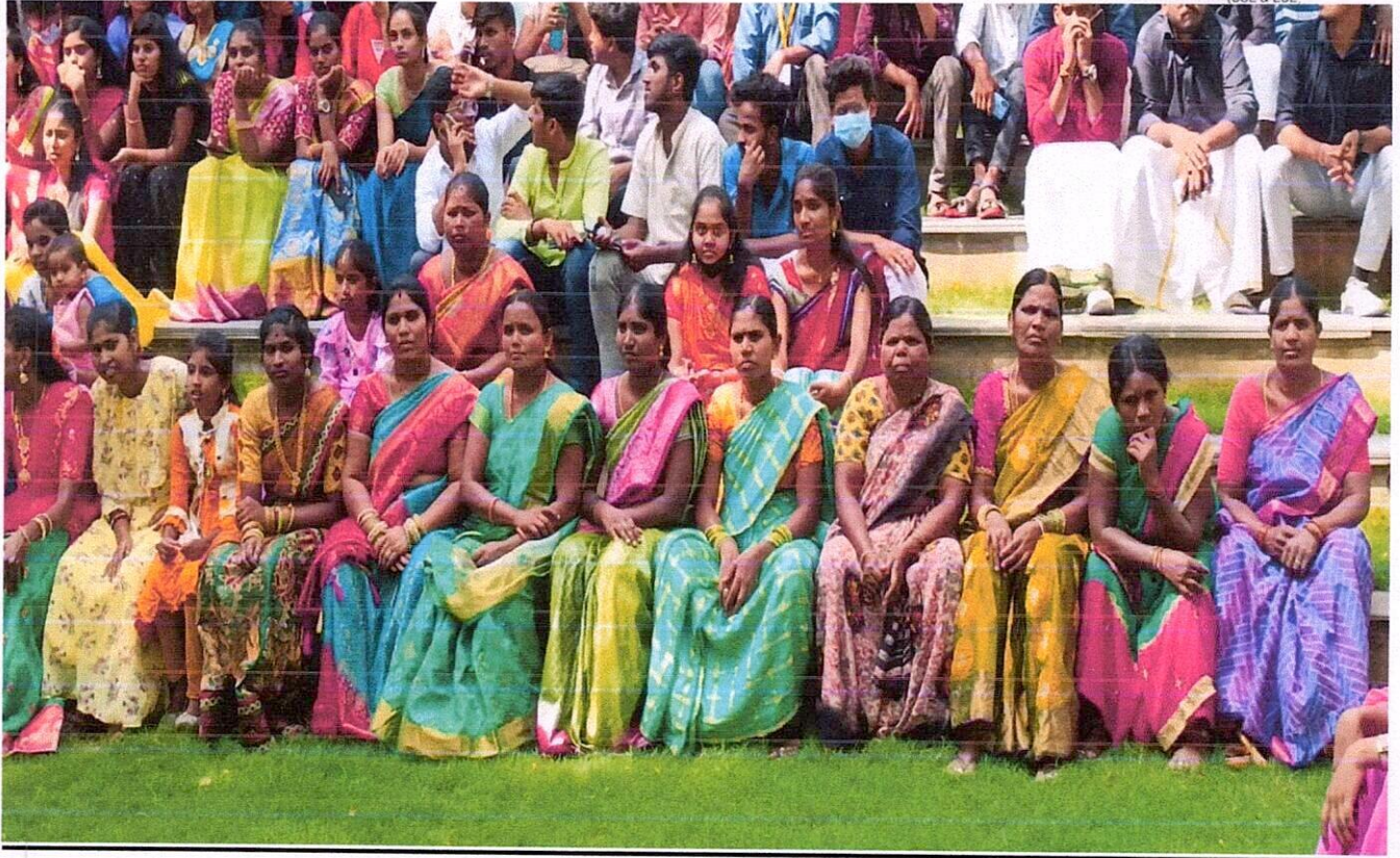
The students and class 4 employees enjoying the program.