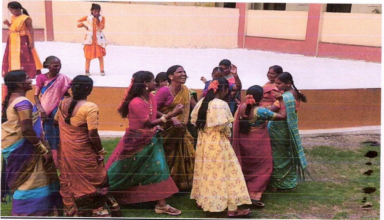
The non-teaching staff enjoying a game.