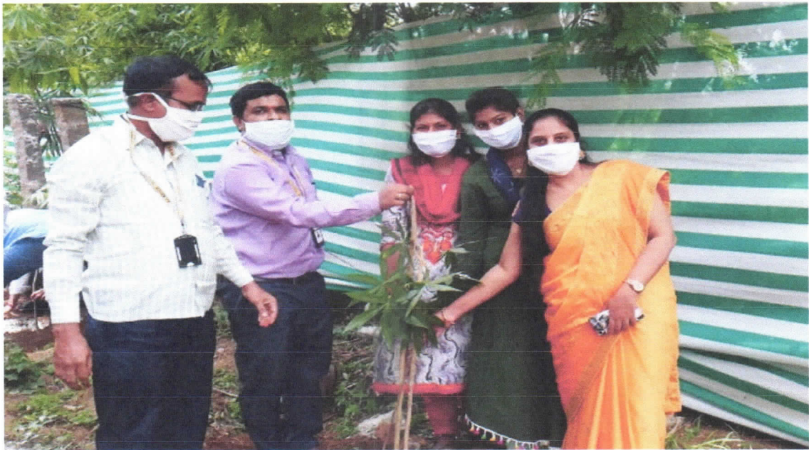
The Staff participated in Haritha Haram