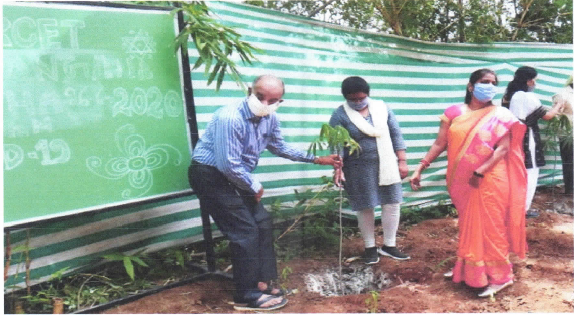
Principal along with staff planting a tree