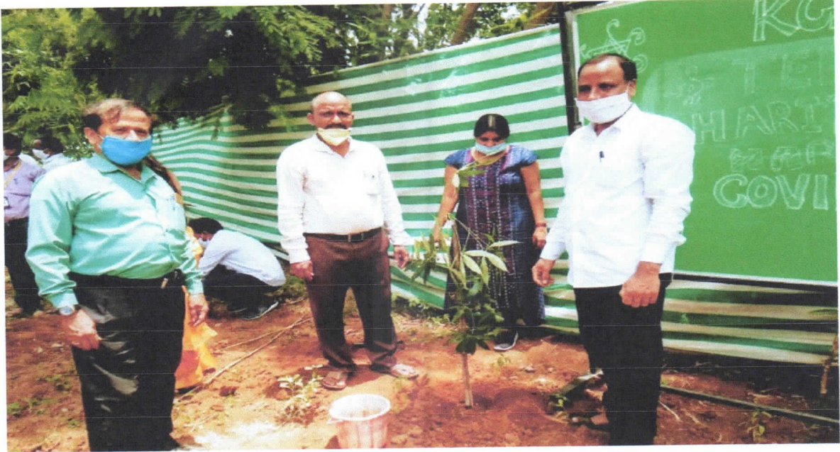
The photograph showing the participants in the Hariha Haram program