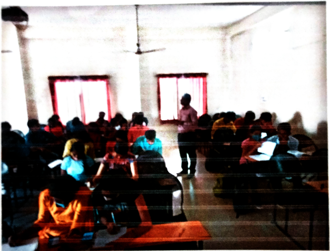
In Voter Awareness programme students were Discussion each other