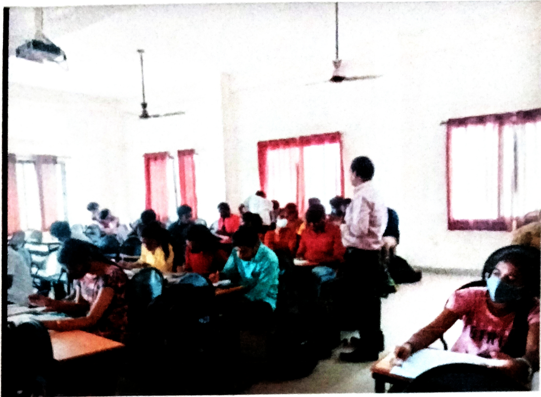
Students Participated in voter Awareness programme