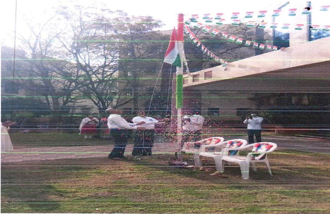
National flag hoisted by Principal Sir on 26/01/2022