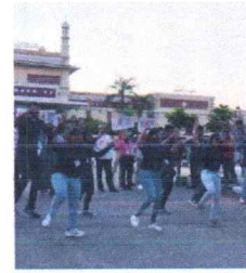
The photograph of the participants in Stop India Spitting Movement