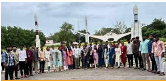
A group picture at ISRO.

Final-year students visited the Indian Space Research Organization (ISRO) on 29 August 2024. They visited Satish Dhawan Space Centre (SDSC) SHAR, Sriharikota, to enhance their technical skills and upgrade their career opportunities.